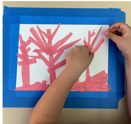
Step 2 Using painter's tape, tear or cut tree-like shapes and apply them to your paper.