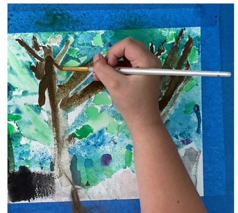
Step 6 Add details to the painting. Use a paintbrush or other tools to add paint to your artwork!