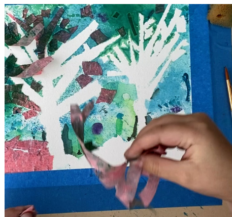
Step 5 Once the painting is dry, remove the painter's tape.