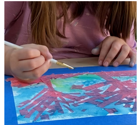
Step 3 Paint shapes of rocks and grass, and let dry.