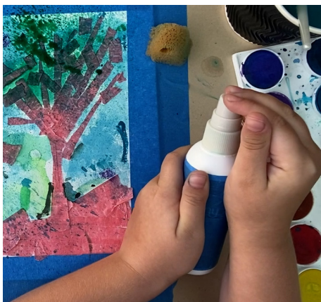
Step 4 Using the spray bottle, spray paint directly onto the paper or fill a toothbrush with paint and flick paint on your creation!