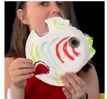
Step 4 Paper Plate Fish If you used glue, let your fish dry. Once the design has set, you can add this fishy to your diorama!