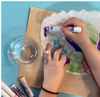
Step 1 Fan Coral Color the coffee filter with markers. Be sure to color all over the coffee filter.