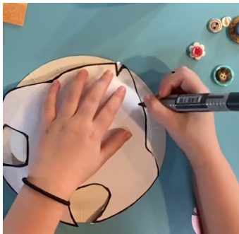
Step 1 Paper Plate Fish Tape the stencil to the plate. Trace the design.