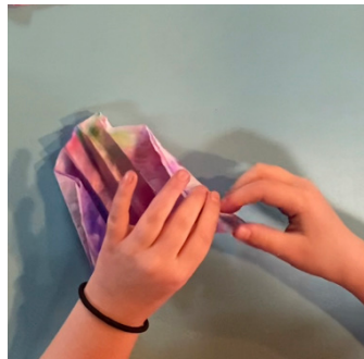
Step 3 Fan Coral Fold the coffee filter in half, and then fold it back and forth accordion style.