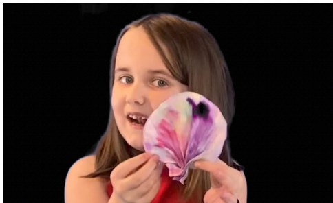
Step 5 Fan Coral Now it is ready for the diorama!