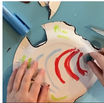
Step 3 Paper Plate Fish Decorate your fish. This is your creation. Anything goes!