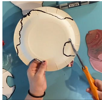
Step 2 Paper Plate Fish Cut out the fish following the traced design.