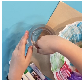
Step 2 Fan Coral Drip water onto the coffee filter. The colors will bleed together. Wait for it to dry.