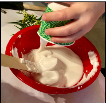
Step 5 Add both glue and shaving cream into your bowl.