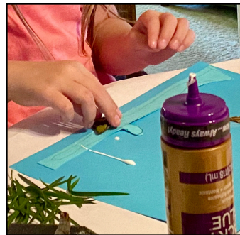
Step 3 Make a nature collage by gluing the items you found to your paper. A collage is a picture you make with found items.