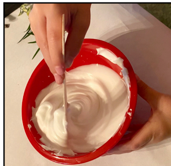
Step 6 Using your spoon or craft stick, whip together the glue and shaving cream. It will get thicker. You may add glitter or food coloring at this time.