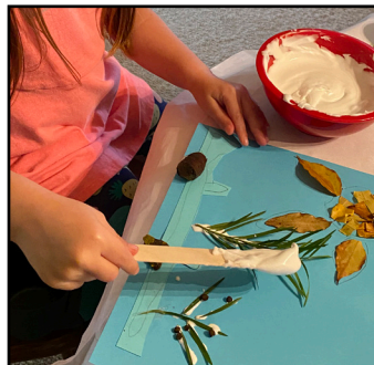
Step 7 Paint the "snow" onto your collage. You can use any extra snow paint to make your own creations.