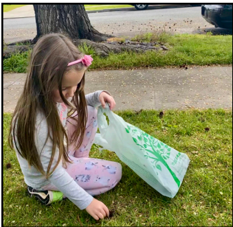
Step 1 Collect craft scraps or natural materials. We took a walk in our neighborhood and found sticks, leaves, bark, and petals.